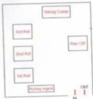
Seating Arrangement at the polling station