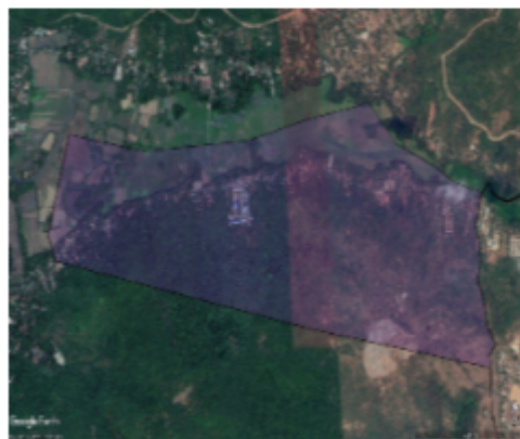
Google Map View