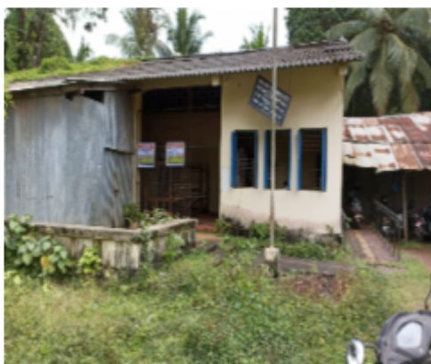
Polling Station Building Front View